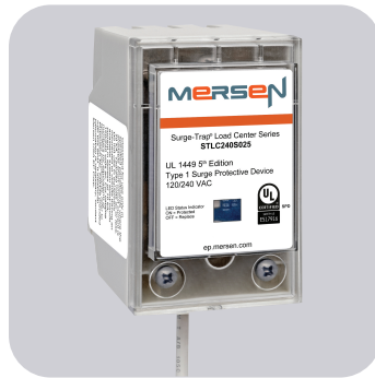
Dimensions (in Inches)

Mersen's STLC surge protective device adds a critical layer of surge protection to the entire home. This simple whole house solution is installed directly in the electrical panel and has flexibility to fit in a variety of different load center manufacturers and models. The STLC Series satisfies the new 2020 NEC Article 230.67 requirement for surge protection for residential dwellings.