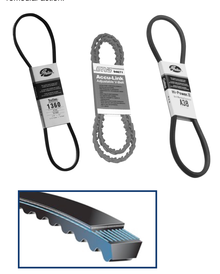
Motors & Armatures, Inc. distributes both Gates and MARS brand high quality V-belts.

Unusual vibration or "squealing" on start – up can be signs of belt wear, pulley or bearing wear and are cause for remedial action.